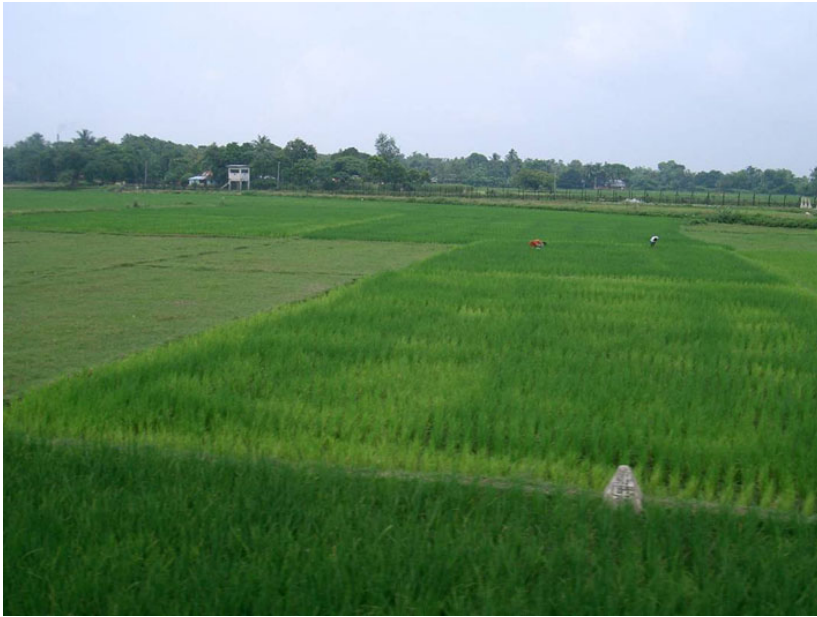
Figure 2 [In color online, see http://dx.doi.org/10.1068/d10108 ] The 150 m zone. This photograph is taken from Bangladesh looking into India. In the foreground, a border stone is visible, which marks the official border. In the background, the fence and a BSF tower can be seen. In the zone are several farmers, presumably from India (photograph taken by the author, September, 2006).

Question: “Is it a problem living this close to the border?”